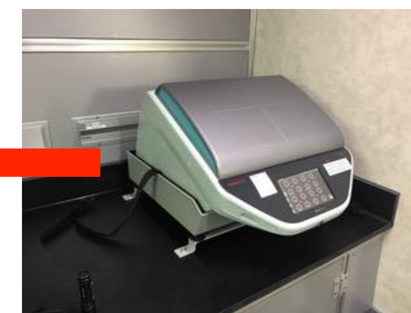
TECTA B16 installed in Singapore PUB's mobile lab